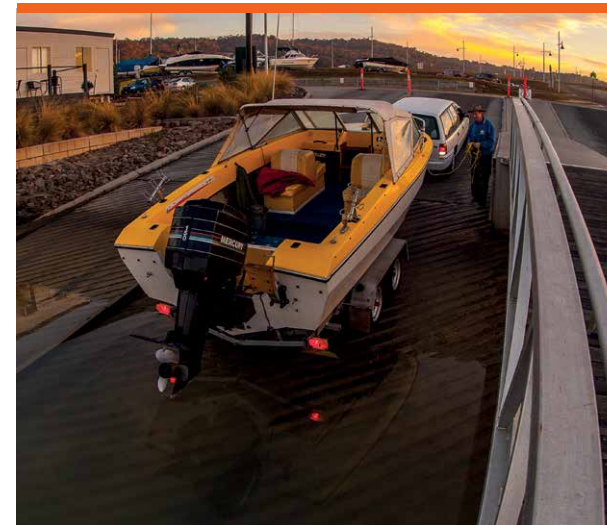
Reverse off trailer and slowly move away from the ramp to a suitable spot.