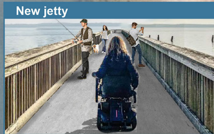
A Realign south jetty northwards by approx. 3 metres to reduce congestion in ramp and water access area. Replacement jetty to be 3.6 m wide providing all ability access, recreational fishing and walking.