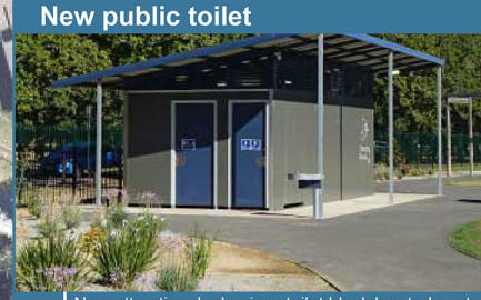
B New attractive dual unisex toilet block located next to yacht club with sealed all ability access pathway from pier entry and carpark, cost effective due to adjacent services and safe direct line of sight visual access for all users.