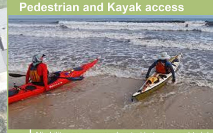
C All ability access ramp, located between yacht club and heritage pavilion, providing graded safe access to the beach and water for people of all ages and abilities, and easy access for kayak users.