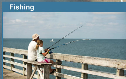
K Visitors and fishers enjoy can catch a wide diversity of fish in Western Port Bay, including the jetties being popular for squid fishing.