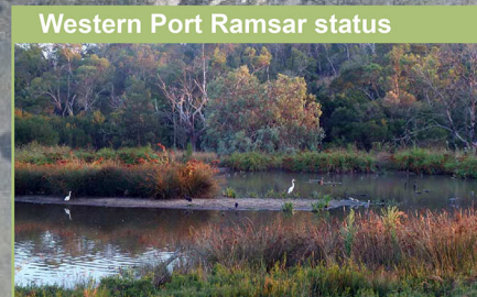
H The Western Port Ramsar site is internationally significant, and has long been recognised for its diversity of native flora and fauna, particularly for its ability to support diverse assemblages of waterbirds and wetland vegetation, including seagrass, saltmarsh and mangroves including habitat for migratory shorebirds.