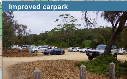
F New car park arrangement providing enhanced organisation, circulation and safety for users and retaining the capacity of 89 car and trailer parking places, and 25 car spaces.