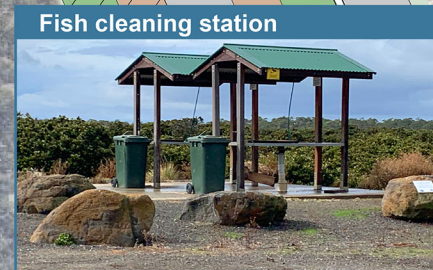
G Retain the two fish cleaning stations which are widely used by anglers.

The Warneet Boating Precinct Plan has been developed with stakeholders and the community, and sets out the future direction for planning and investment decisions in the precinct. The plan is the first step in this process and it is acknowledged that further studies and technical investigations will be required to support its development and guide implementation. This plan will also help inform various asset managers of the intended direction, when considering funding applications or future upgrades and replacement of infrastructure. This plan is an important step to demonstrate Government agencies and stakeholders endorsement the key outcomes of the Warneet Boating Precinct Plan