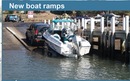
D Replace two existing concrete launch ramps with new concrete boat ramp structures with extended reach into deeper water for ease of launch and retrieval.