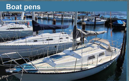
J Long term opportunity for provision of limited mooring pens to the sides of new jetty, to provide easier all year access for local boat owners, with arrangement, quantity and annual leasing of pens subject to detailed design.