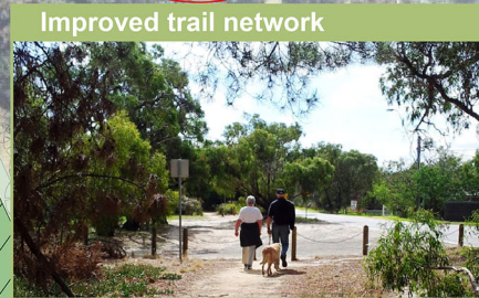
E Improved dedicated pedestrian access within Warneet township as per City of Casey planning.